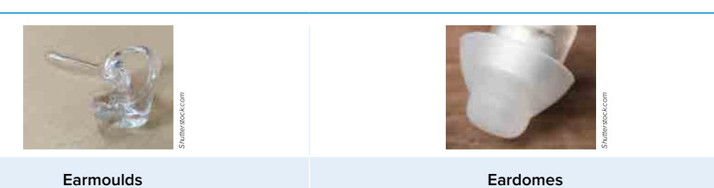
FIGURE 3: EARMOULDS AND EARDOMES