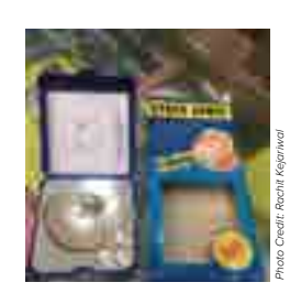
FIGURE 4: HEARING AID SOLD THROUGH SMALL ELECTRONIC STORES

4.5. National health insurance systems in HICs have been able to increase adoption rates, sustainably deliver services and reduce prices obtained on Big 5 models through volume-based negotiation.